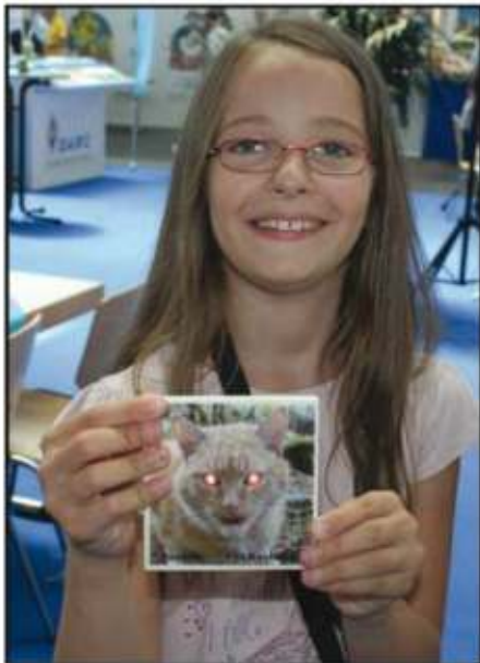
Young people of all ages — and species — made an appearance at Friedrichshafen, as captured in this pose to CQ photographer Joe Eisenberg, K0NEB.