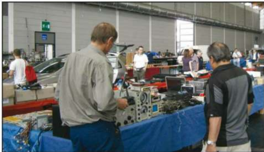
Set-up in the display areas at the annual convention in Germany is full of amateur radio eye candy, even before all the vendor covers are removed.

example, inviting hams with interesting careers — such as pilots, scientists, astronauts, missionaries, motorcycle police officers, entertainers, clowns, athletes, and so on — whom we had spoken with on the air, to visit our classroom.